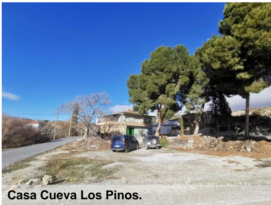
Casa Cueva Los Pinos.