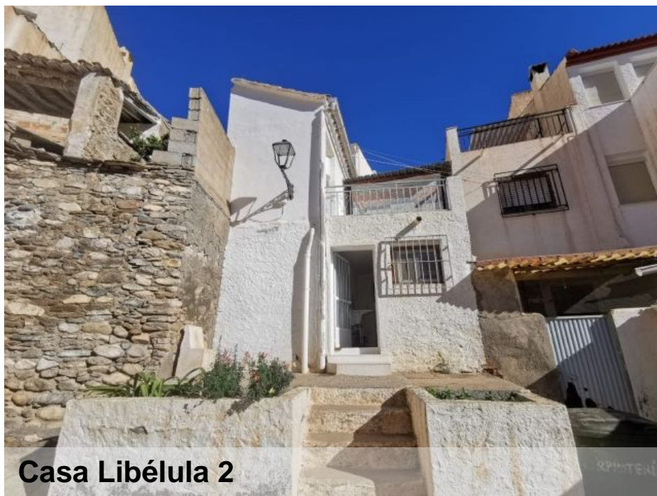
Casa Libélula 2