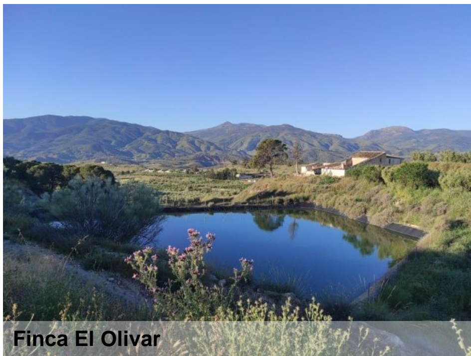
Finca El Olivar