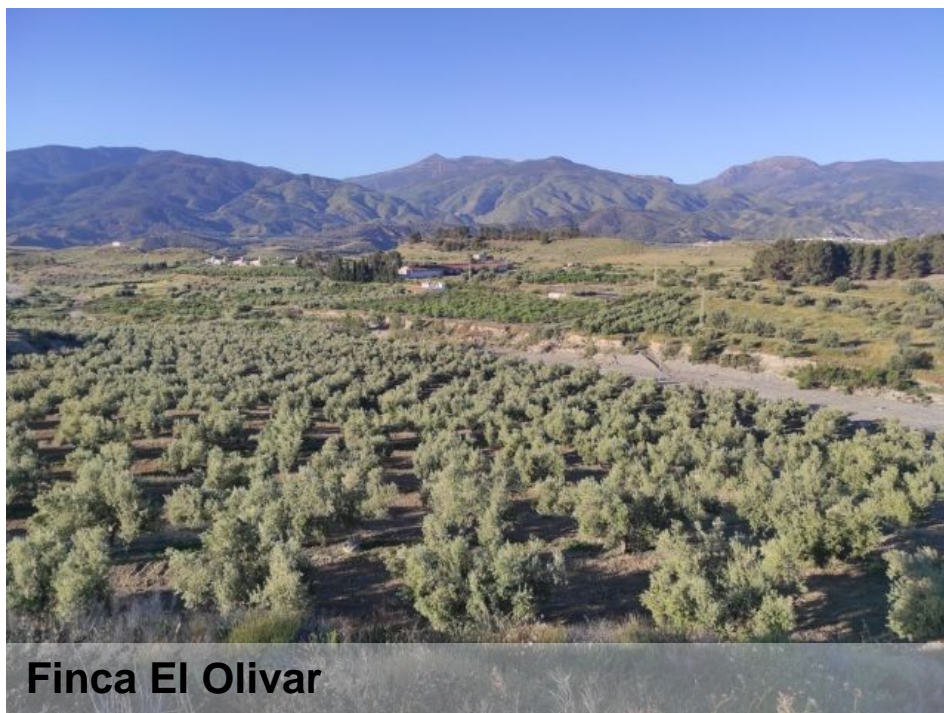
Finca El Olivar