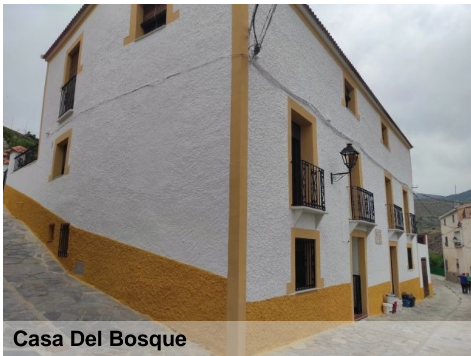
Casa Del Bosque