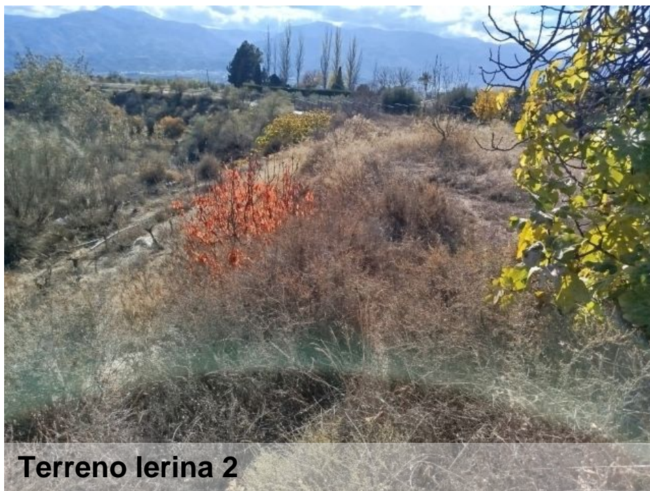
Terreno lerina 2