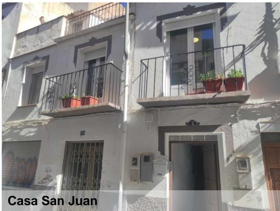
Casa San Juan