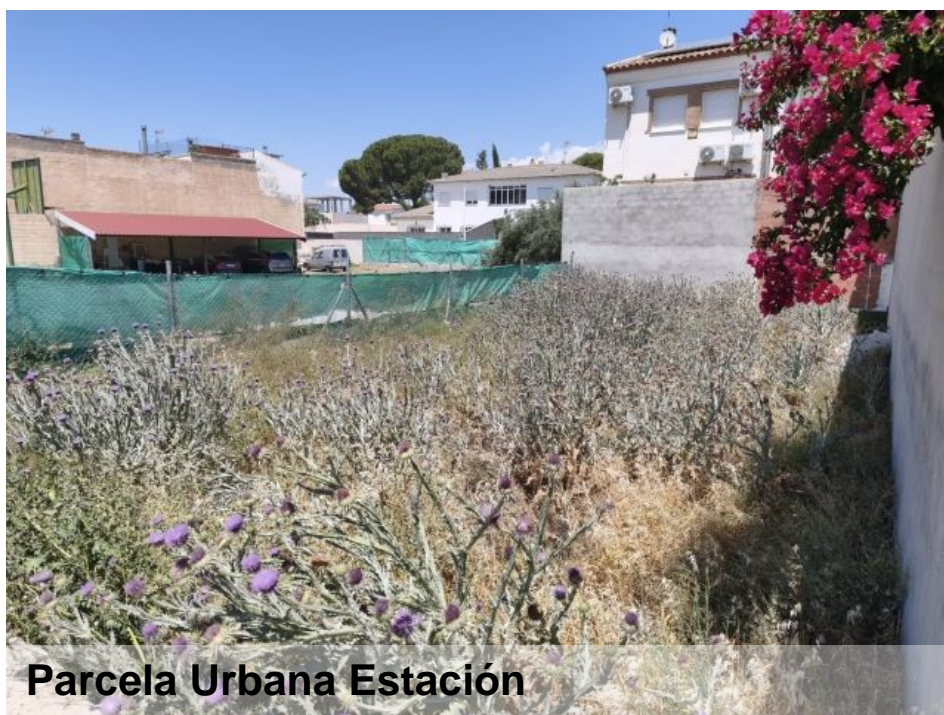
Parcela Urbana Estación