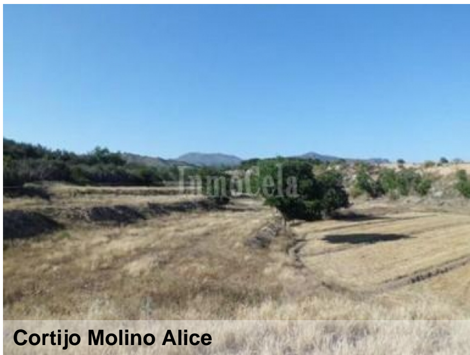
Cortijo Molino Alice