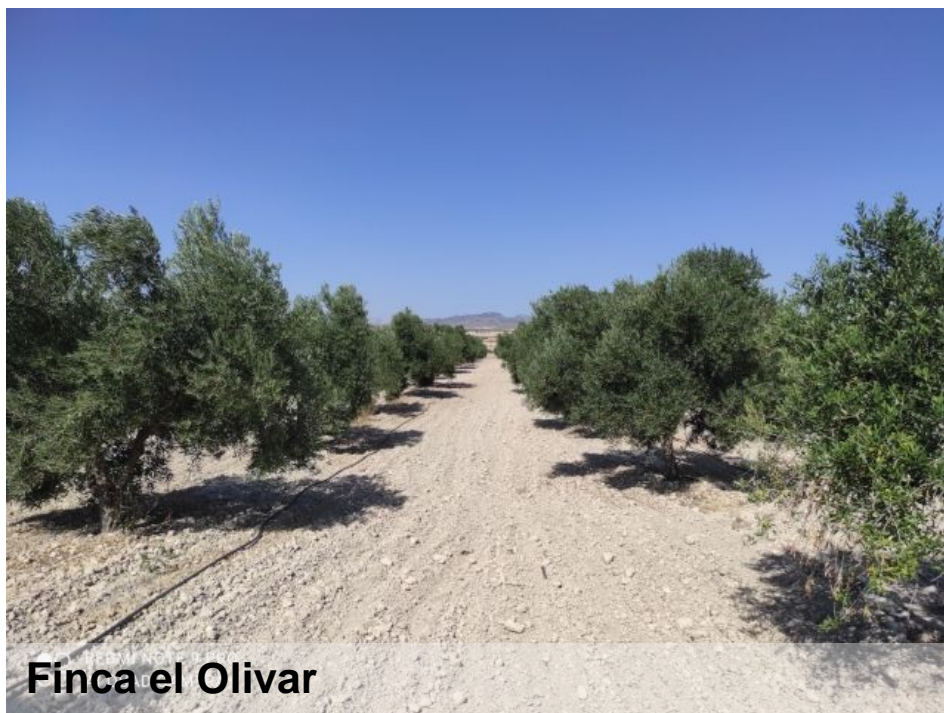
Finca el Olivar