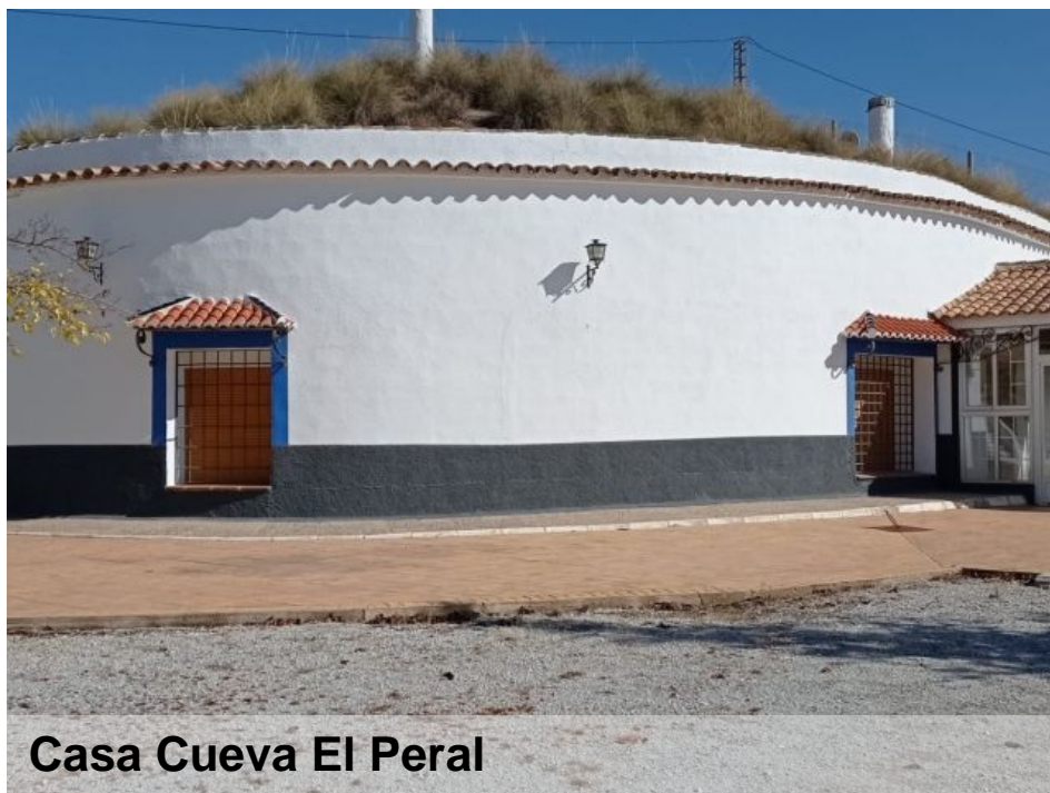
Casa Cueva El Peral