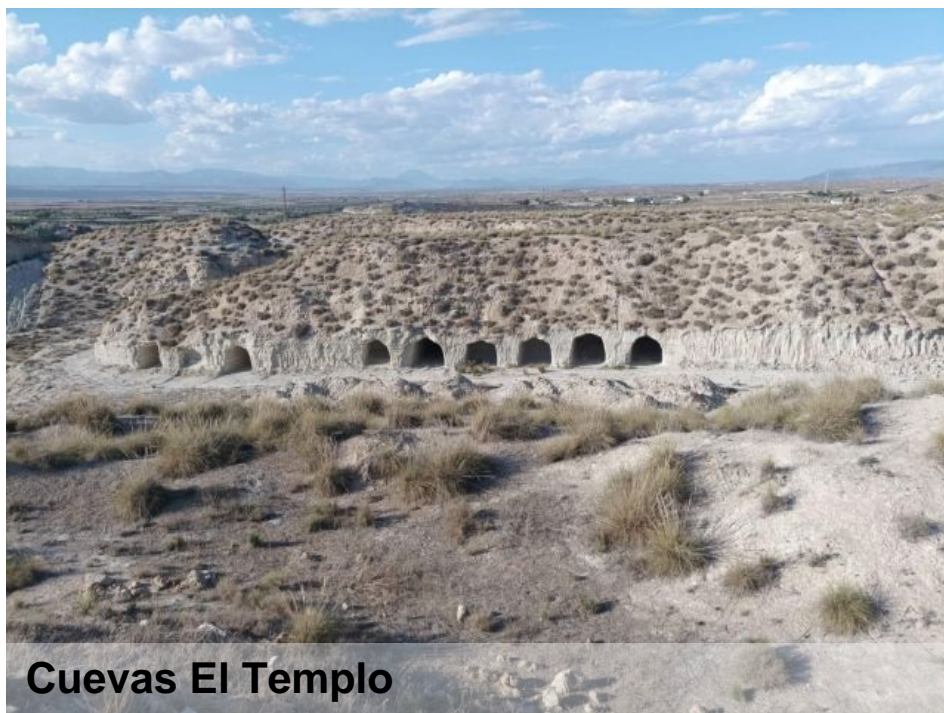
Cuevas El Templo