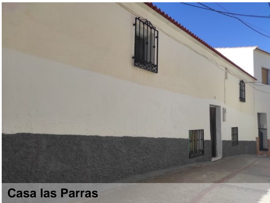
Casa las Parras