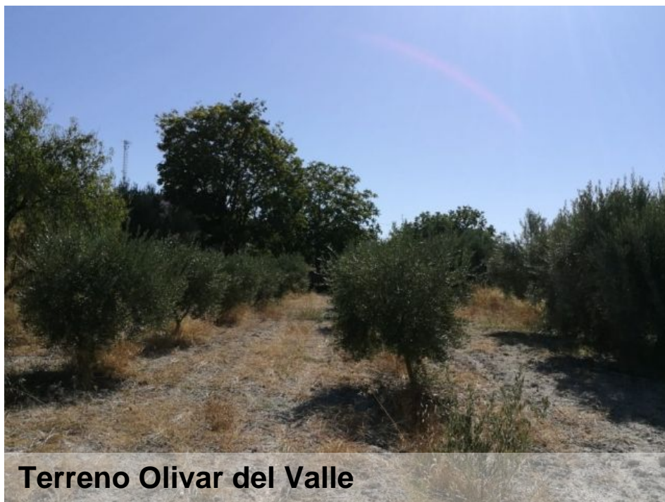
Terreno Olivar del Valle