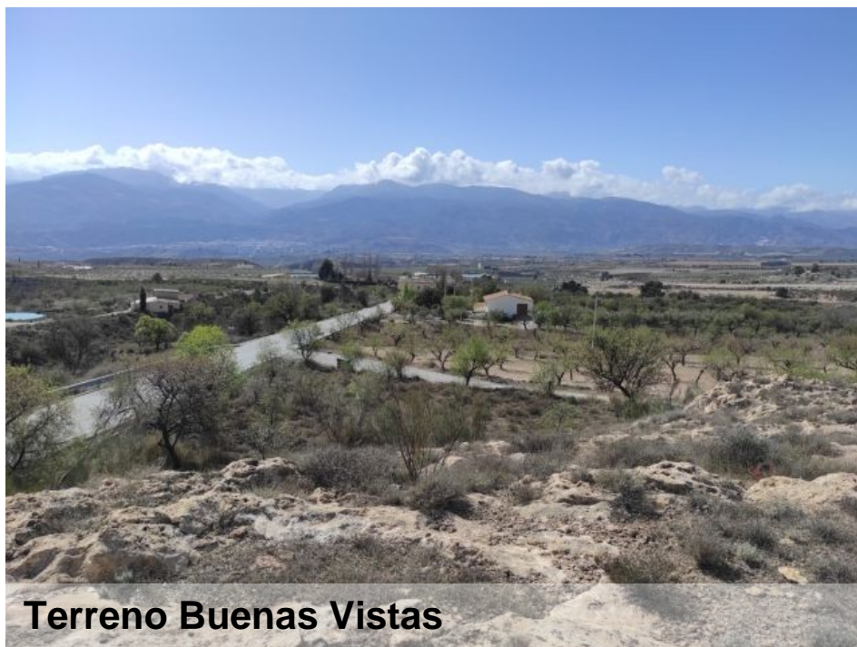
Terreno Buenas Vistas