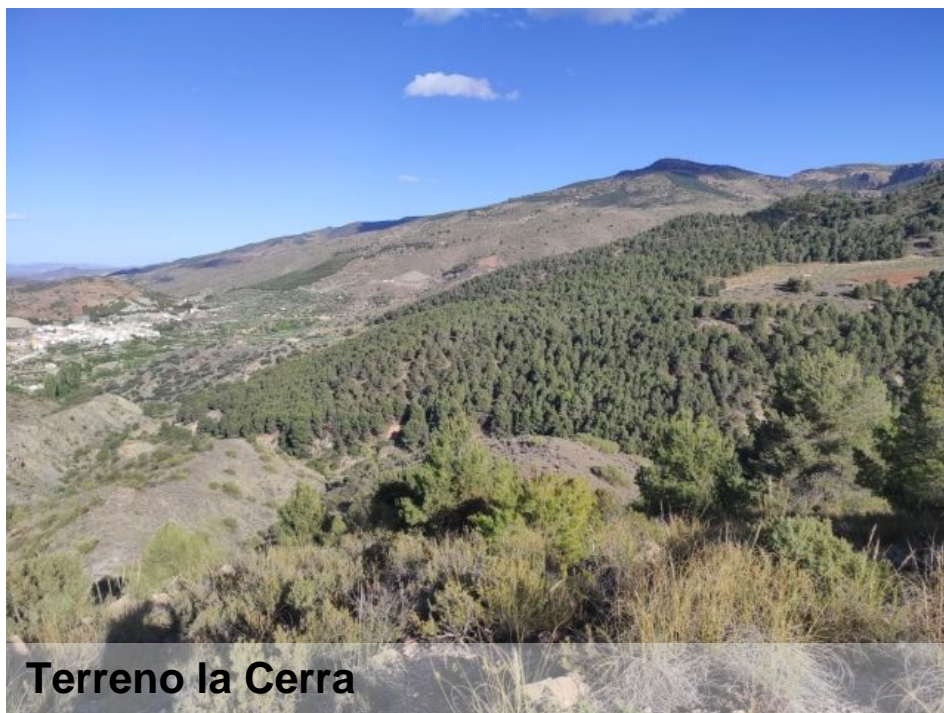
Terreno la Cerra