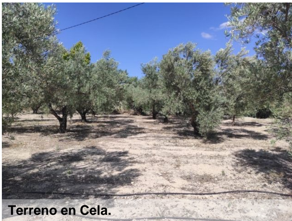
Terreno en Cela.