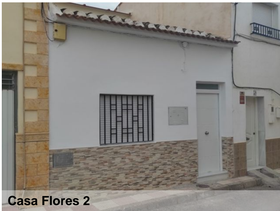
Casa Flores 2