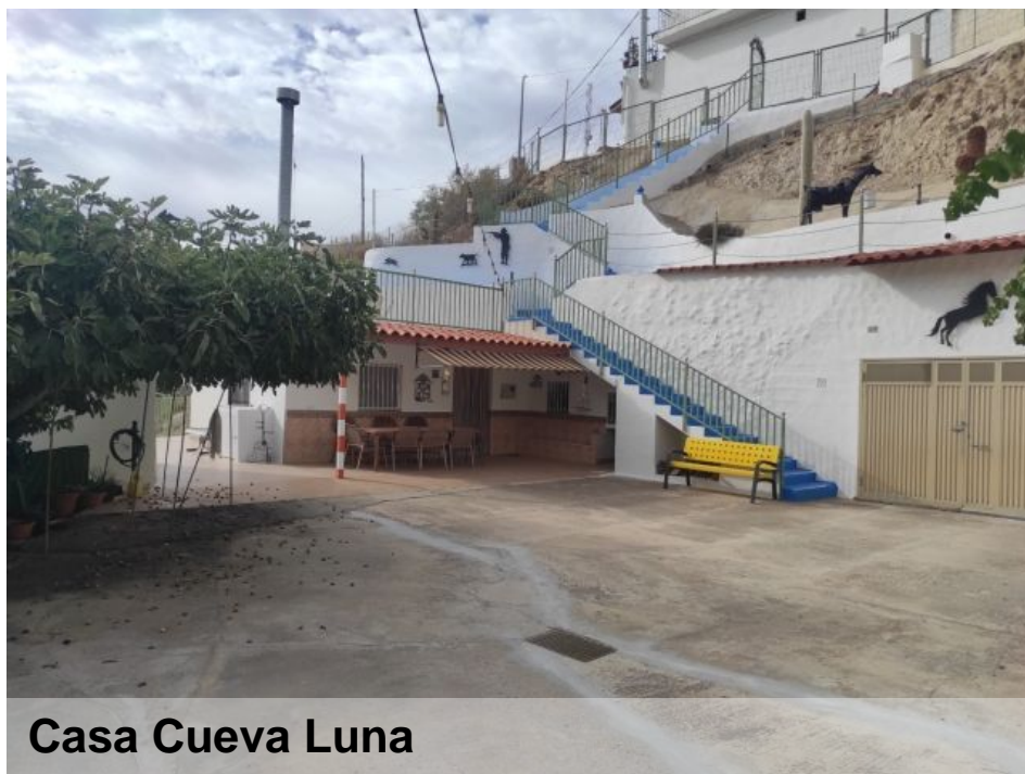
Casa Cueva Luna