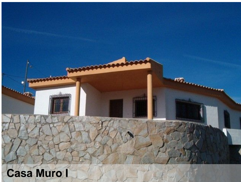
Casa Muro I