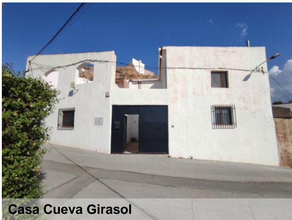
Casa Cueva Girasol