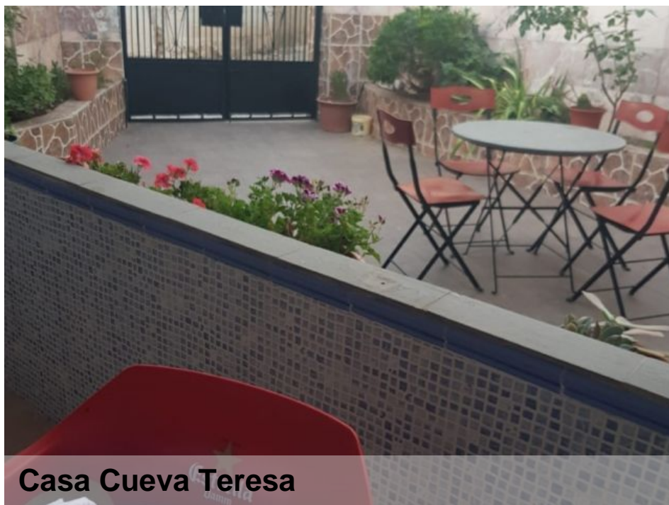
Casa Cueva Teresa