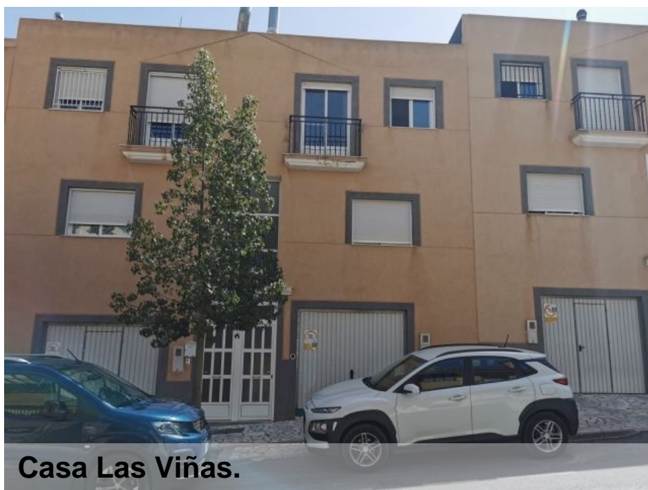
Casa Las Viñas.